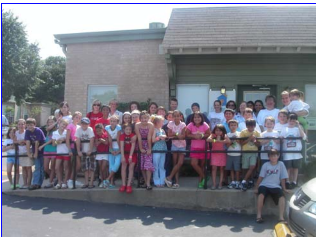
Matthew Road Baptist Church Youth Group Thank you for your donation of welcome bags.

Cost for the training is $25 which covers training materials. There will be a variety of speakers on topics including: Orientation & Overview of Brighter Tomorrows; Volunteer Job Descriptions; Introduction to Sexual Assault & Domestic Violence; Reporting & Documentation and much more.