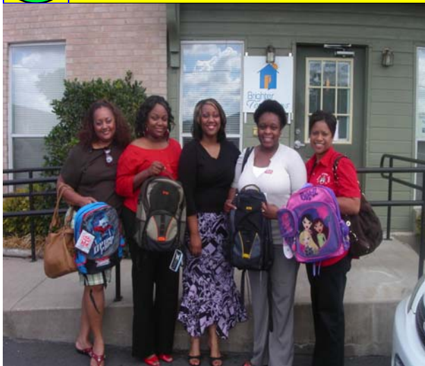
Delta Sigma Theta, Sorority, Inc. Arlington Chapter

It is that time of year again, and thanks to several of our generous supporters, the children we serve are ready to head back-to-school prepared and ready for another great school year.